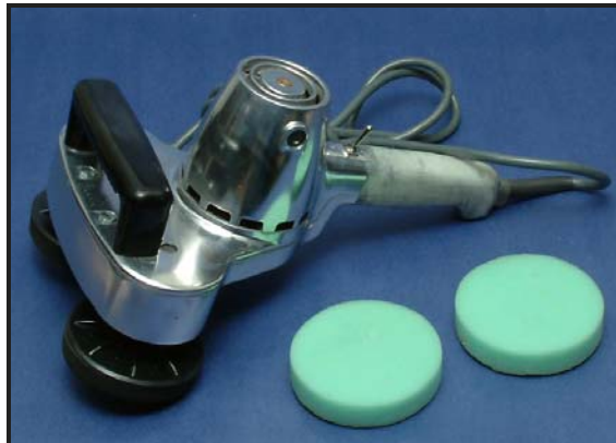
Nuvite #EQ-137 Cyclo Model 5 110v Twin Head Orbital Polisher (Includes Hook & Loop adapter boots and foam backup pads)